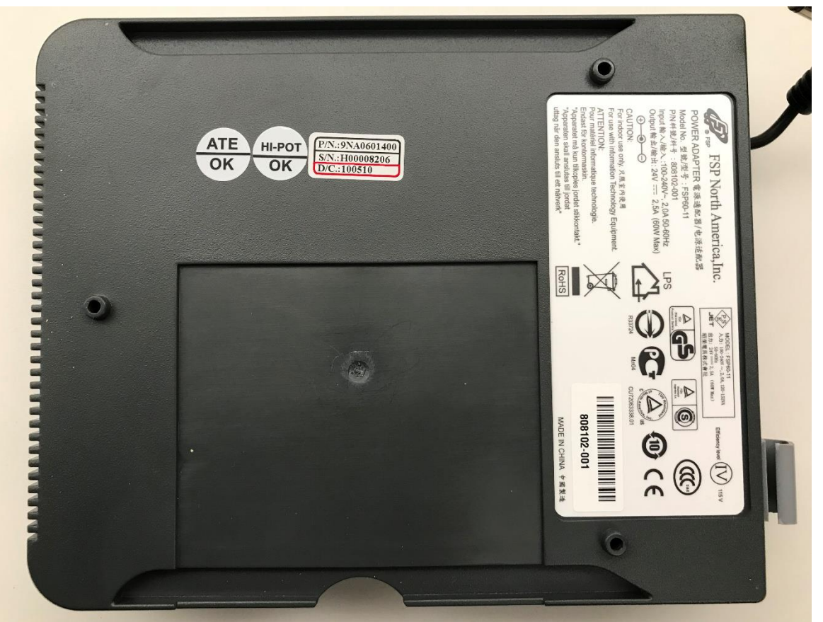
The above example shows a date code of 100510