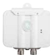
AP 6562E Outdoor 802.11n Up to 600 Mbps 2x2 MIMO